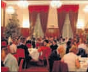
Christmas at St Augustine's, Westgate, is a sumptuous occasion

At the call for dinner your guests will be invited into the Ruby Hall, where magnificent chandeliers glisten and sparkle, the perfect setting to enjoy a delicious three-course dinner while listening to our cabaret singer. As the meal concludes, the party will be brought to life as the DJ and cabaret singer play festive favourites.