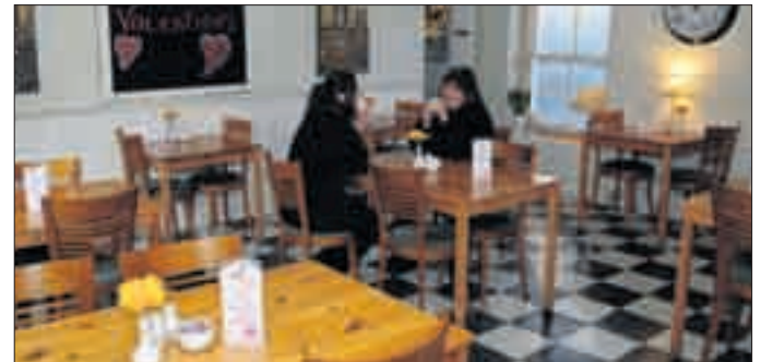
Try Bistro Oregano for Valentine's Day Picture: Paul Amos PD1668959

The special three-course Valentine menu, is served